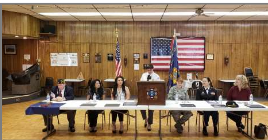
Post 1650 Recognition of Women in Military service Program.