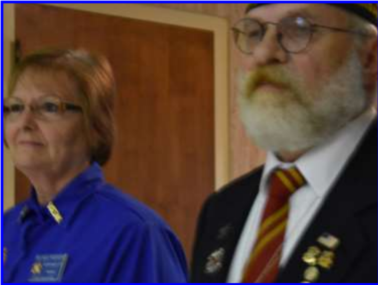
Eisenhower Vigil October 12, 2018