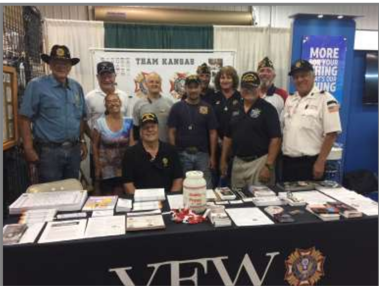
State Fair Booth