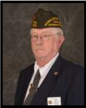
National Council Member