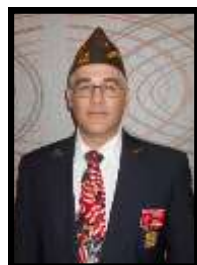
6th District Commander