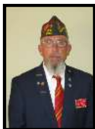
5th District Commander