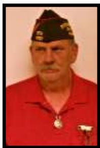
4th District Commander