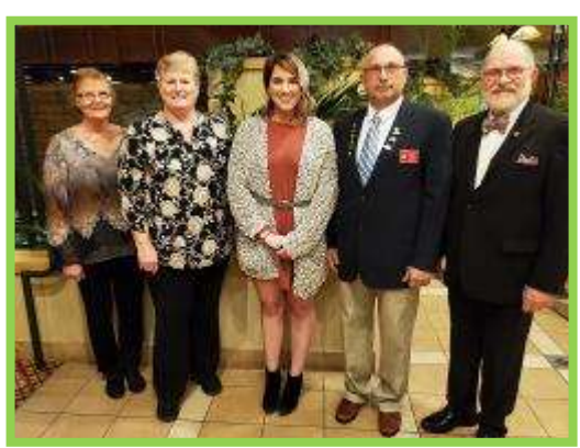
The Kansas Bulletin