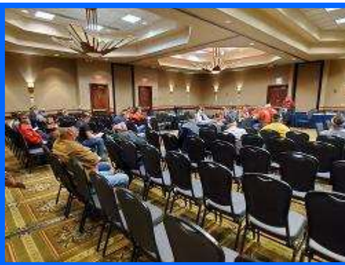
The Kansas Bulletin