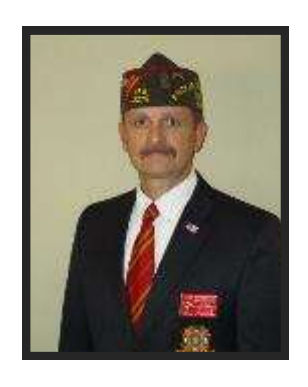
State Jr. Vice Commander