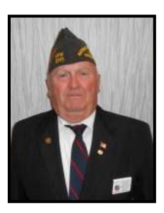
State Chief of Staff