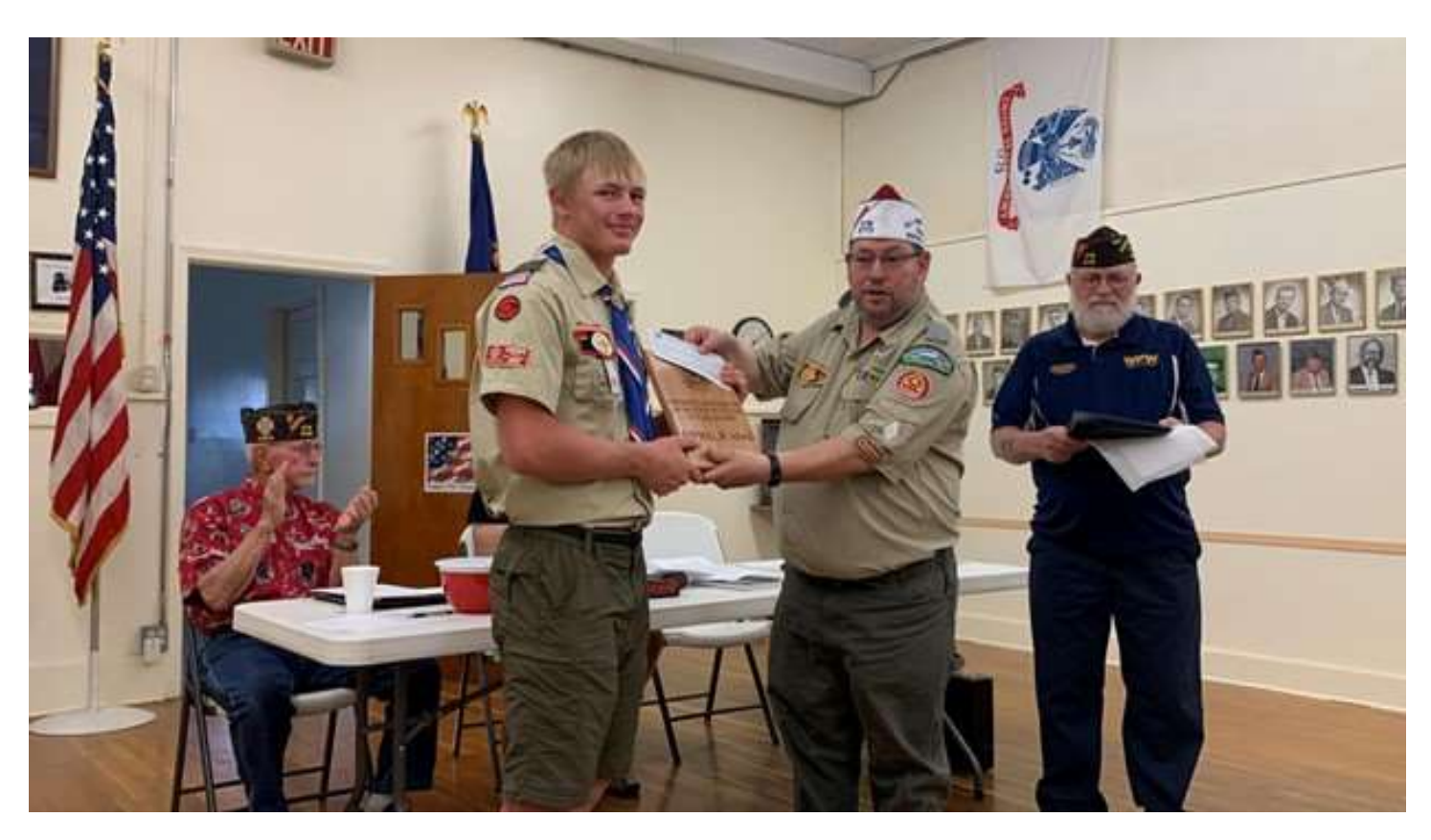
Ezekial Haag VFW Post 9139 Ellis, Kansas